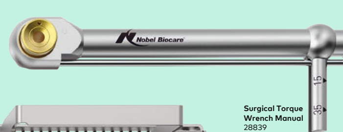
Surgical Torque Wrench Manual 28839