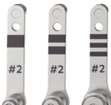
Guided Drill Guide NP #2: Article 32814 #3: Article 32817 #4: Article 35882